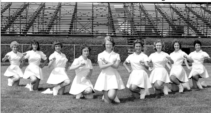
1959 Delaware All ★Star Gold Cheerleading Team

Here's the latest....Wachovia has awarded DFRC $15,000 as the proud sponsor of our 2006 Blue-Gold All ★Star Banquet and has initiated a long-term partnership to support the mission of DFRC.