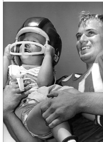
Blue-Gold All★Star Football Player and Buddy, 1962

Ticket Order and Sponsorship Forms inside