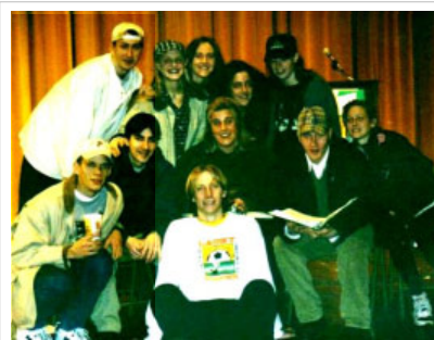
Members of the 1996 Saint Mark's Blue-Gold Club